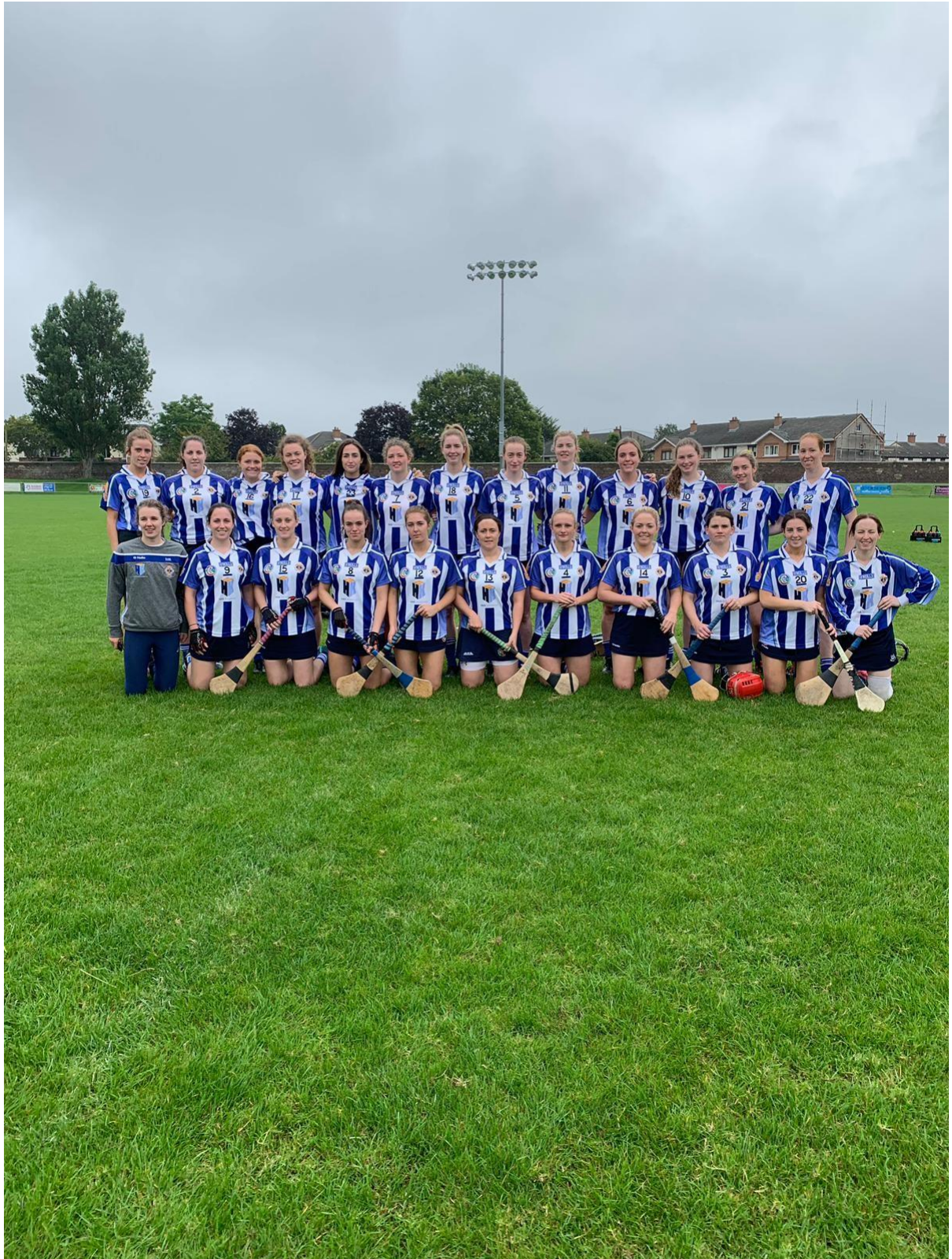
Ballyboden St.Endas Vs. St. Vincents Senior A Championship Senior A Camogie Championship – 25th August 2019

The Ballyboden St.Enda's Senior A Camogie team's first outing in this year's championship was against St. Vincents, arguably one of the favourites for this year's title. The Marino