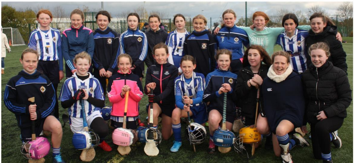
A late call up for our U12 Camogie as they took on Kilmacud on Saturday at a hastily arranged challenge on a miraculously available Benildus All Weather following a week of rain and cancellations. This was the first meeting between the clubs at this level for a while,