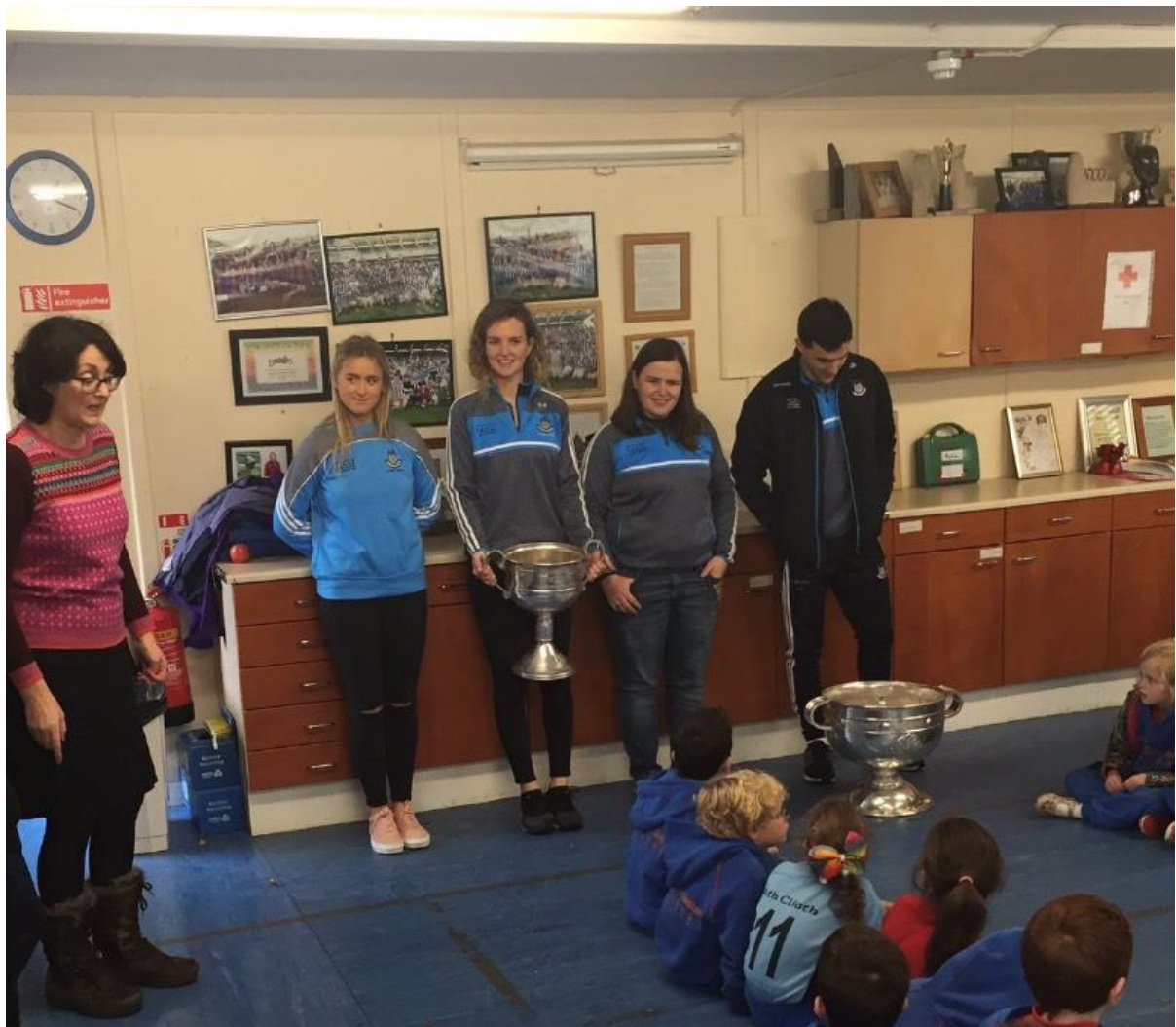
Príomhoide Ghaelscoil Chnoc Liamhna ag éirí as a post